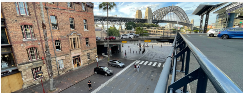
Realignment of parking spaces on the left side of the road.