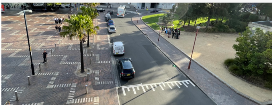
New parallel parking bays.