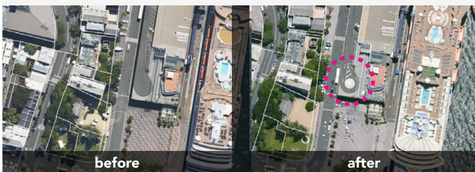
Installation of linemarking and signage to improve the existing car park such as a roundabout on the podium level.