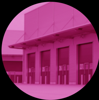
Top trends and ideas