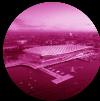
Case study: New Sydney Fish Market

We examine how new building projects are taking up the notion of creating smarter loading docks – starting with a holistic approach to demand planning, civil design, traffic engineering, and building or asset value creation.