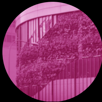
Sustainability and design